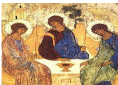
Andrei Rublev 15 th C Russian