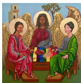
Icon by Kelly Latimore USA