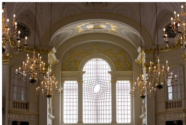
St Martin-in-the-Fields East Window Designed by Shirazeh Houshiary in collaboration with architect Pip Horne installed in 2008.