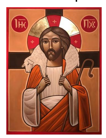
Lamb of God - Coptic Icon

Dear Everyone – Greetings to you all and hoping all is well.