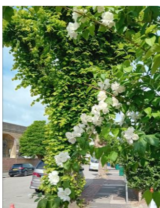
Passing by on my morning walk with the dogs