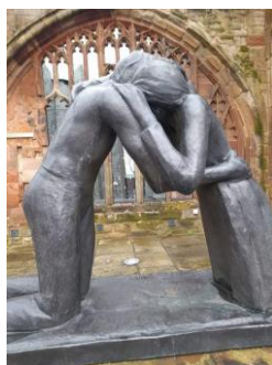
Bronze sculpture in the ruins of Coventry Cathedral

Bring comfort to those who grieve, shelter to those who are homeless, and sustenance to those who hunger and thirst. God of mercy, open our hearts to your grace, so that we are filled with compassion and a generosity of spirit, and inspire us to take action. Spirit of love, pour out your peace like a healing balm, which brings hope in place of despair.