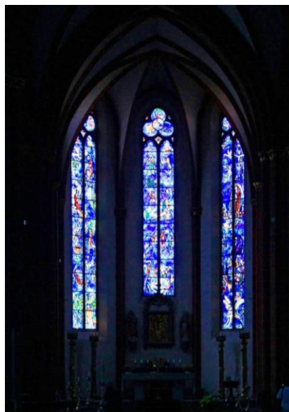
Reconciliation Windows The Stephanskirche, Mainz, Germany