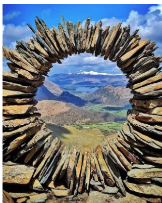
The mystery artwork of an unknown artist dubbed "the Borrowdale Banksy" in the Borrowdale Valley Lake District of Cumbria,