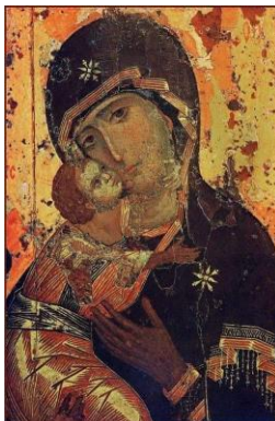
The Virgin of Kyiv by a Byzantine artist about the year 1132