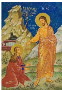
Christ is Risen