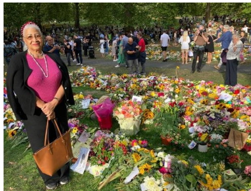
A parishioner sent us a picture of her visiting Green Park where she went to see the flowers in tribute to the Queen

The key qualities of the Queen have been emphasised time and time again, her loyalty, faithfulness, stability, love, and a very strong sense of Service for others, and, of course, her Christian Faith. But they are not just qualities for a Queen, they are ours too, to live by and try to keep, as hard as it so often is. The Archbishop of Canterbury recognised all this in his sermon given at Westminster Abbey, which is printed in full below. So, whether monarchist or not, what took place on Monday was a time that will be etched on our memories, for the late Queen and for ourselves. It will not be easily forgotten.