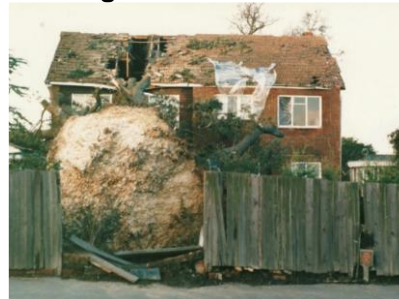
Two pictures from the aftermath of the 1987 storm