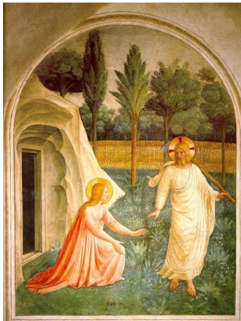
Noli me Tangere- 'Touch me not. ' Fra Angelico 1442

Men called you light so as to load you down, And burden you with their own weight of sin, A woman forced to cover and contain Those seven devils sent by Everyman. But one man set you free and took your part One man knew and loved you to the core The broken alabaster of your heart Revealed to Him alone a hidden door, Into a garden where the fountain sealed, Could flow at last for him in healing tears, Till, in another garden, he revealed The perfect Love that cast out all your fears, And quickened you with love's own sway and swing, As light and lovely as the news you bring.