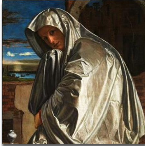
Mary Magdalene is painting by Giovanni Girolamo Savoldo c.1535-1540, now in the National Gallery,