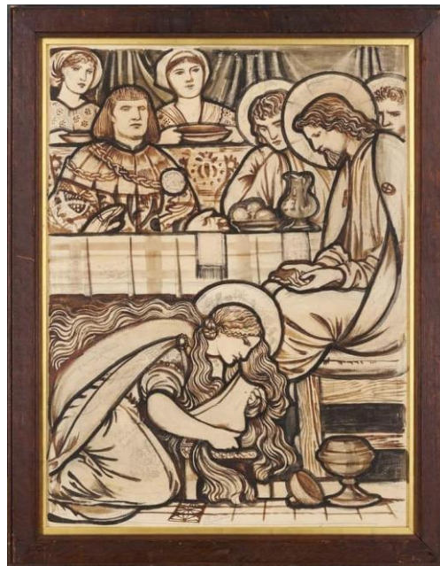
Etching of the Woman Washing the Feet of Jesus

Greetings to everyone. We are now approaching the most important time in the Christian Calendar remembering Jesus telling his disciples they must go to Jerusalem together, undergo great suffering and for Jesus to face death. It is not surprising they all had a negative reaction, with Peter turning on him in his predictable way, saying, “ God forbid it Lord, this must not ever happen to you ” (Matthew 16.21-28). A real dilemma for them as it would be for us too. How would we have reacted I wonder. This coming Sunday is Palm Sunday, the beginning of Holy week/Passion week, it has several names, in which we daily think about his journey towards the Cross and ultimately the Resurrection which brings such hope to us all. On Palm Sunday after the service at 12.00 we will be processing from the Golders Green Library in the high street to the Clock Tower with members of other churches. Please do come and bring your palms which you will be given in church at the beginning of the Service. It will be so good to see everyone there.