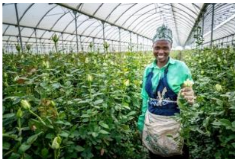
Panda Flower Farm Kenya

As we continue through Fairtrade Fortnight, here is a reflection which you may find helpful, or challenging, or both! It's followed by a prayer.