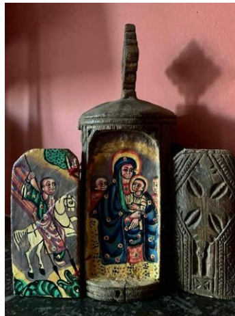
An Ethiopian Travelling Icon